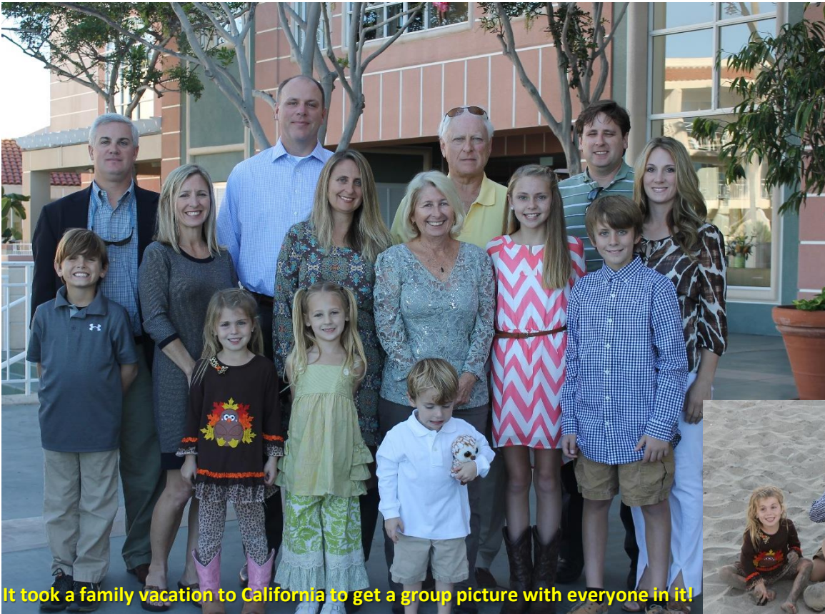
It took a family vacation to California to get a group picture with everyone in it!