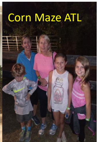
Corn Maze ATL