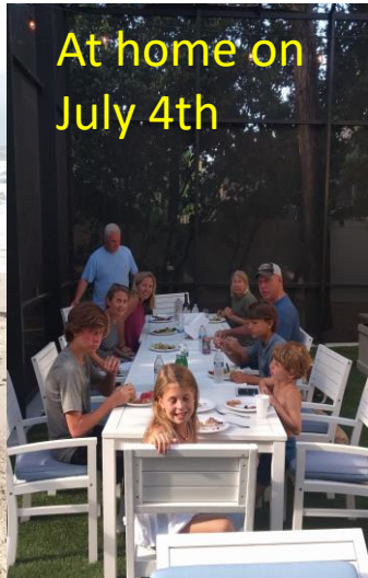
At home on July 4th