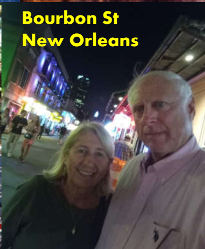
Bourbon St New Orleans