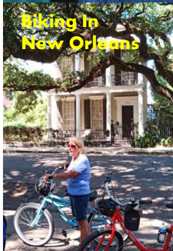
Biking In New Orleans